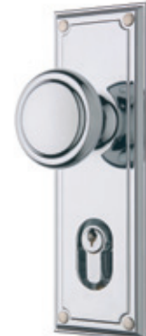
890 TRI BC